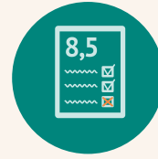
The testing and assessment of students