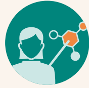
The provision of education