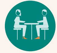
The supervision of students